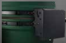
Aero Lift Hinge System