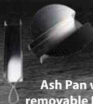
Ash Pan with removable Drawer