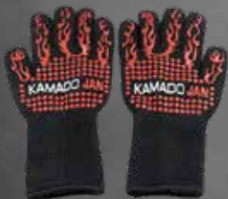
Heat Resistant Gloves - Pair