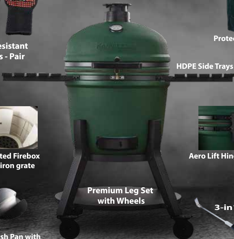
HDPE Side Trays