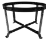
GRILL STAND WITH HANDLES