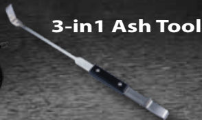
3-in1 Ash Tool