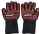
HEAT RESISTANT GLOVES - PAIR