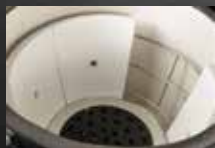
Segmented Firebox & cast iron grate